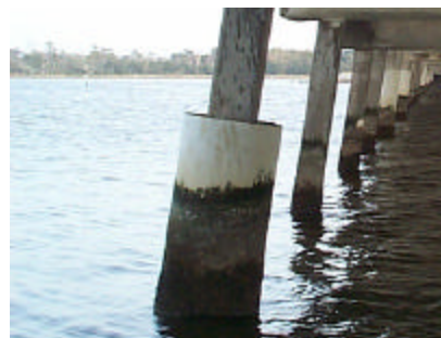
Figure 4. Concrete Encapsulation