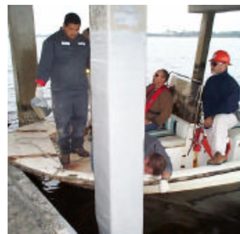
Figure 8. Completed installation