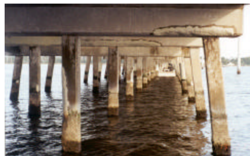
Figure 2. Concrete deterioration