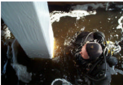
Figure 5. Epoxy adhesive installation