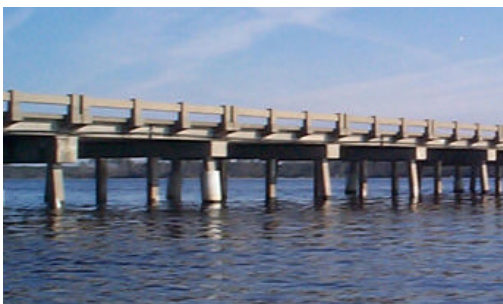
Figure 1. Bridge over the North River

Steel reinforced concrete bridge and pier pilings are subject to splash zone damage in both fresh and salt water areas (Figure 2). The damage to the concrete is usually caused by abrasion or impacts by wave and tidal action, collisions with marine vessels, and normal spalling. In addition, oxygen and water penetration can cause corrosion of the reinforcing steel.