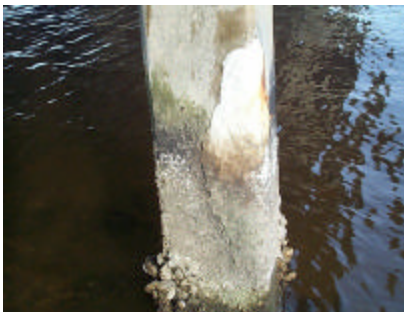
Figure 3. Typical Repair Situation