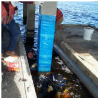
Figure 7. Stretch film application

This was the first installation of this type for the construction crew, yet the entire operation of all three structures was completed in less than one day. The total time was about eighteen man-hours for the contractor staff and six man hours for the diving crew.